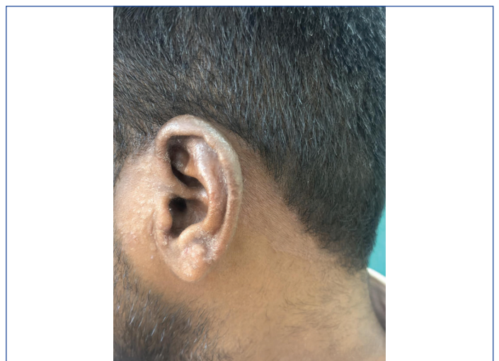
[Table/Fig-7]: Lesions on the face and neck which also extended to the scalp.

addition, a few studies have indicated an increasing incidence of tinea faciei in both adults and children [4].